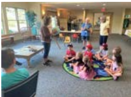
Attention to the lesson