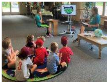
Captivated by the Word