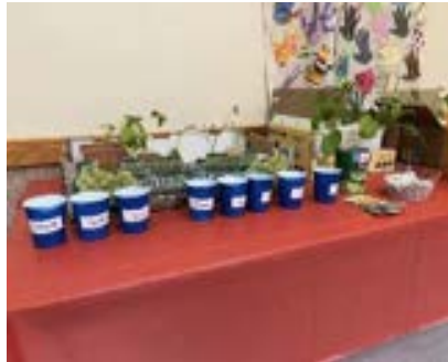
Seedlings and planted seeds