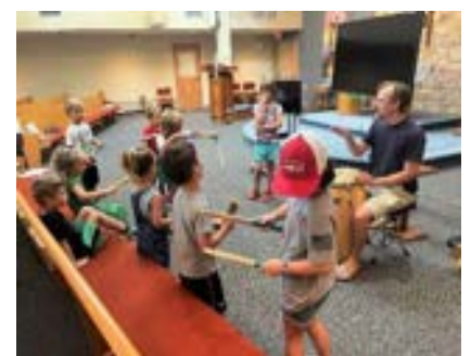
Praising God in rhythm