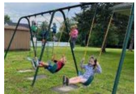
Kids in motion