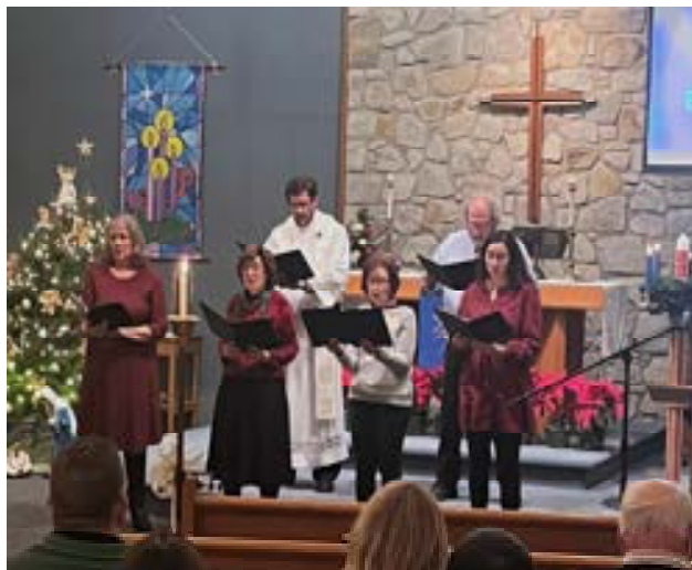
Vocal Choir Christmas Eve