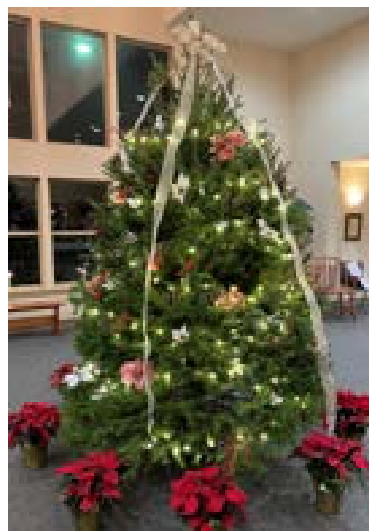
The beautiful, fragrant and welcoming Christmas Tree of 2022