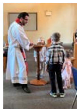
Explanation of Baptism