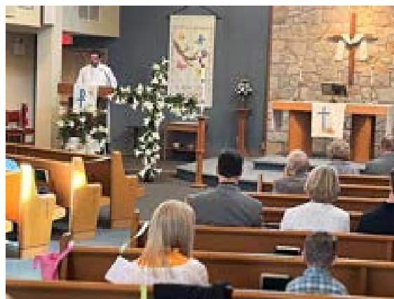
Preaching of God's Word