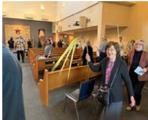
Parade of the Palms