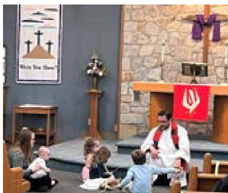
Palm Sunday Children's Sermon