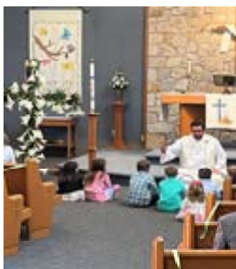
Easter Sunday Children's Sermon