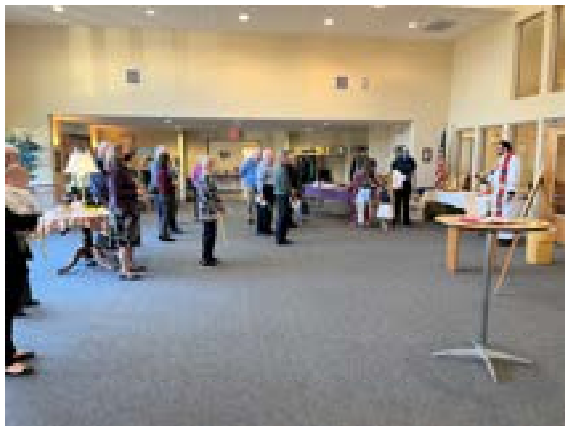
Distribution of Palms in narthex