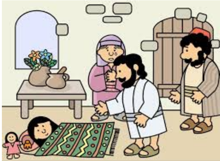
We Gather in Jesus' Name